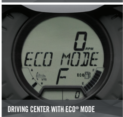
DRIVING CENTER WITH ECO® MODE