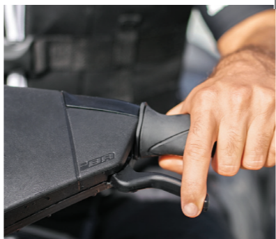
iBR® (INTELLIGENT BRAKE & REVERSE)