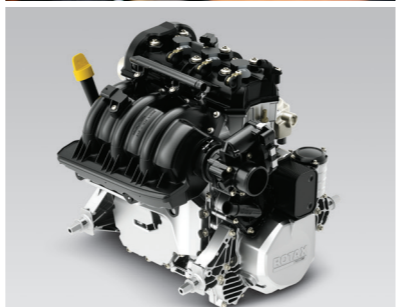
ROTAX® 900 HO ACE™ ENGINE