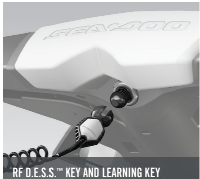
RF D.E.S.S.™ KEY AND LEARNING KEY