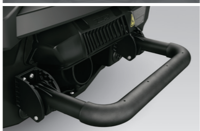
REBOARDING LADDER (ACCESSORY)